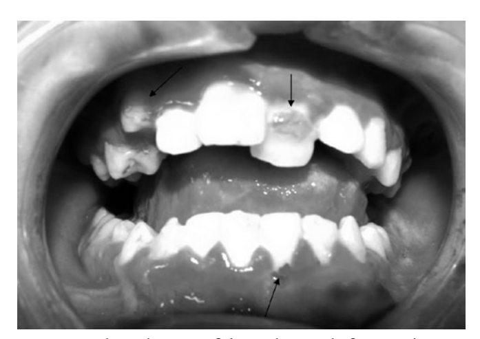
Figure 2 - Clinical aspect of the oral cavity before intubation. Presence of gingivitis, food residues and dental overcrowding (arrows).

and seizures and was successfully resuscitated after 5 minutes. He was referred to the intensive care unit (ICU) under mechanical ventilation with a diagnosis of septic shock secondary to nosocomial pneumonia. Respiratory and hemodynamic support, fluid resuscitation, noradrenalin, ceftazidime, sedation and midazolam plus fentanyl were provided. In addition to the medical and physiotherapy care, the patient was assessed by the ICU's team dentist, who confirmed the previous admission diagnosis and started specialized care. On the patient's 4th day in the hospital, several plain sores with erythematous bed, off-white halo and elevated borders were observed on the lips, jugal mucosa, inserted gum