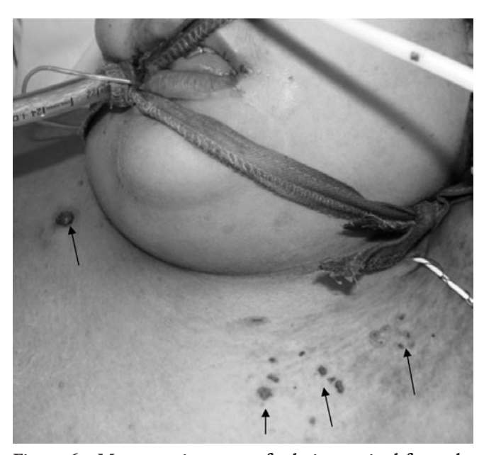
Figure 6 - Macroscopic aspect of a lesion excised from the tongue.

physiotherapy and dental therapy, the patient died on the 14th day of his hospital stay.