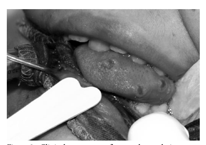
Figure 3 - Clinical appearance of tongue herpes lesions.

Empirical topical aciclovir therapy was started, with good outcome. The skin lesions, initially considered to be traumatic, were cleaned with saline and treated with topical chlorhexidine. The next days after the biopsy, the patient progressed, with worsened neurological status, deepened coma, neck stiffness, bilateral Babinski sign and generalized tonic-clonic seizures. Herpes encephalitis was suspected on the 13th day in the hospital. Head computed tomography and cerebrospinal fluid examination were requested but could not be performed due to the patient's excessive weight. Despite the treatment, which included hemodynamic and respiratory support, antibiotics, antifungals, vasoconstrictors, analgesia and sedation, in addition to nutrition support,