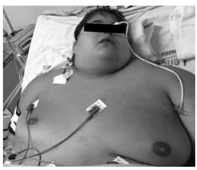
Figure 1 - Clinical aspect of a Prader-Willi syndrome patient.

Two days after hospital discharge, the patient was readmitted with reduced consciousness (Glasgow 6), cyanosis and a large amount of food residue in his mouth. He had a cardiorespiratory arrest, trismus