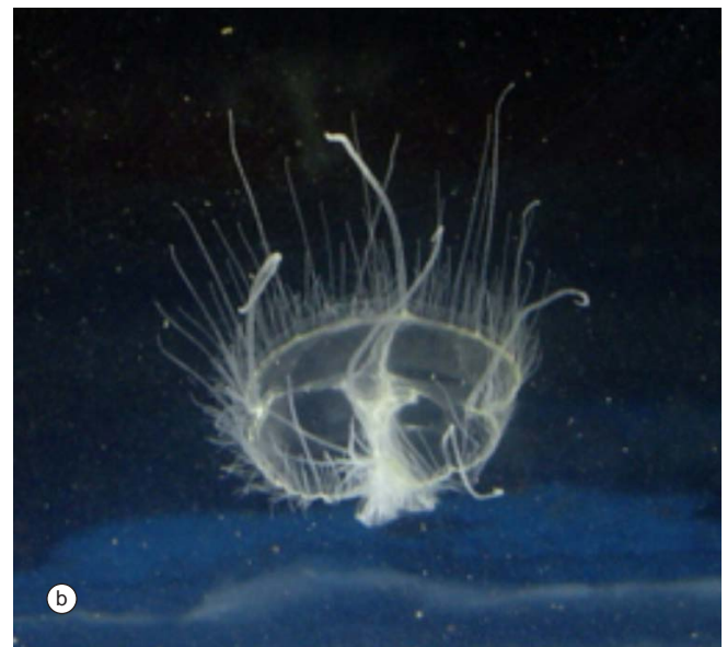
Figure 3. A and B photographs of live individuals of the jellyfish Craspedacusta sowerbii , from Lagoa Misteriosa Lake.

Figura 3. A e B fotografias de espécimes vivos da água-viva Craspedacusta sowerbii da Lagoa Misteriosa.