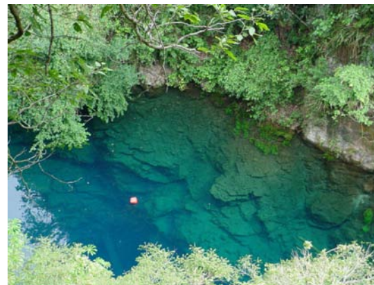
Figure 2. Picture of Lagoa Misteriosa in the dry season.