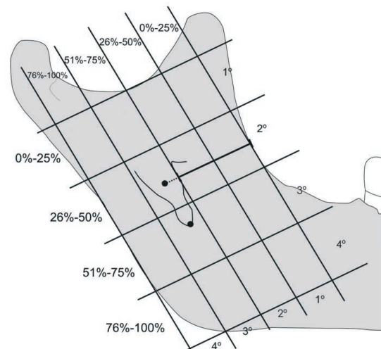
Fig. 2. Scheme of the mandibular ramous division in quadrants.

The quadrant where MF was located, horizontally, was obtained by identifying the distance between the Ab of MR and the mean point of the MF opening hole, calculated by subtracting, from Ab-Pb, the sum of the distances Ab-MF and MF-Pb. The result yields the width of MF. This distance was divided into halves to determine the mean point of the MF opening hole, and added to distance Ab-MF. It was then calculated, in percentage, how much the distance between Ab and the mean point of MF represented in relation to the total distance (Ab-Pb). This value indicated in which quadrant MF was in an anteroposterior location (Fig. 2). Values from 0 to 25% comprised the first quadrant; from 26% to 50%, the second; from 51% to 75%, the third; and from 76% to 100%, the fourth. In vertical direction, the quadrant on which MF was located was identified by calculating how much MI-MF represented, in percentage, of the addition of MI-MF and MF-MB distances (Fig. 2).